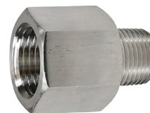
316 stainless steel