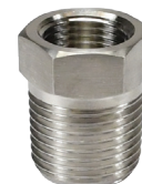
316 stainless steel