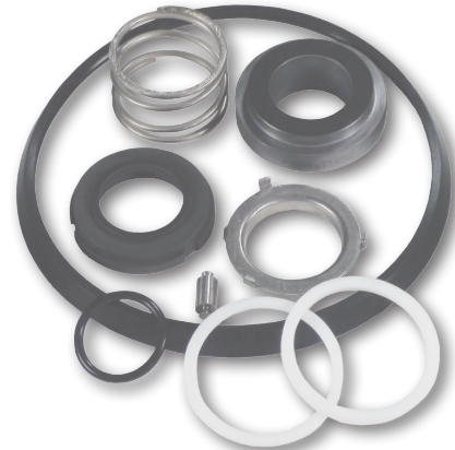
DG Repair Kit

Contains: 1 DG seal seat 1 outboard gasket