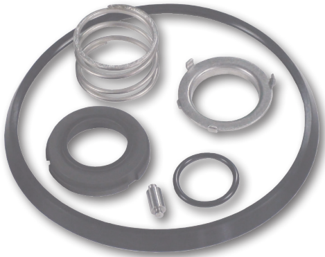
Repair Kit #4

Contains: 1 casing gasket 1 carbon seal 1 seal cup