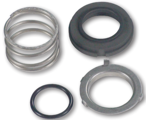
Repair Kit #3