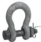
King Safety Shackle

For additional information, please call Dixon Specialty Products at 877.963.4966, or visit dixonvalve.com .